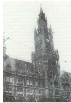
Munich Old Town Hall (Left-Our Group in March 2018, Right- the same building during Nazi Occupation)

Just as each member of our group is diverse in our backgrounds, studies, and beliefs, our reactions and takeaways from the memorial sites we visited was just as disparate. While some felt angry, or overwhelming sadness, others were called to action and motivated to