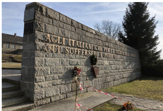
Above: Italian monument at the Mauthausen concentration camp, affirming that Italian nationals who suffered and died there did so “for human dignity”