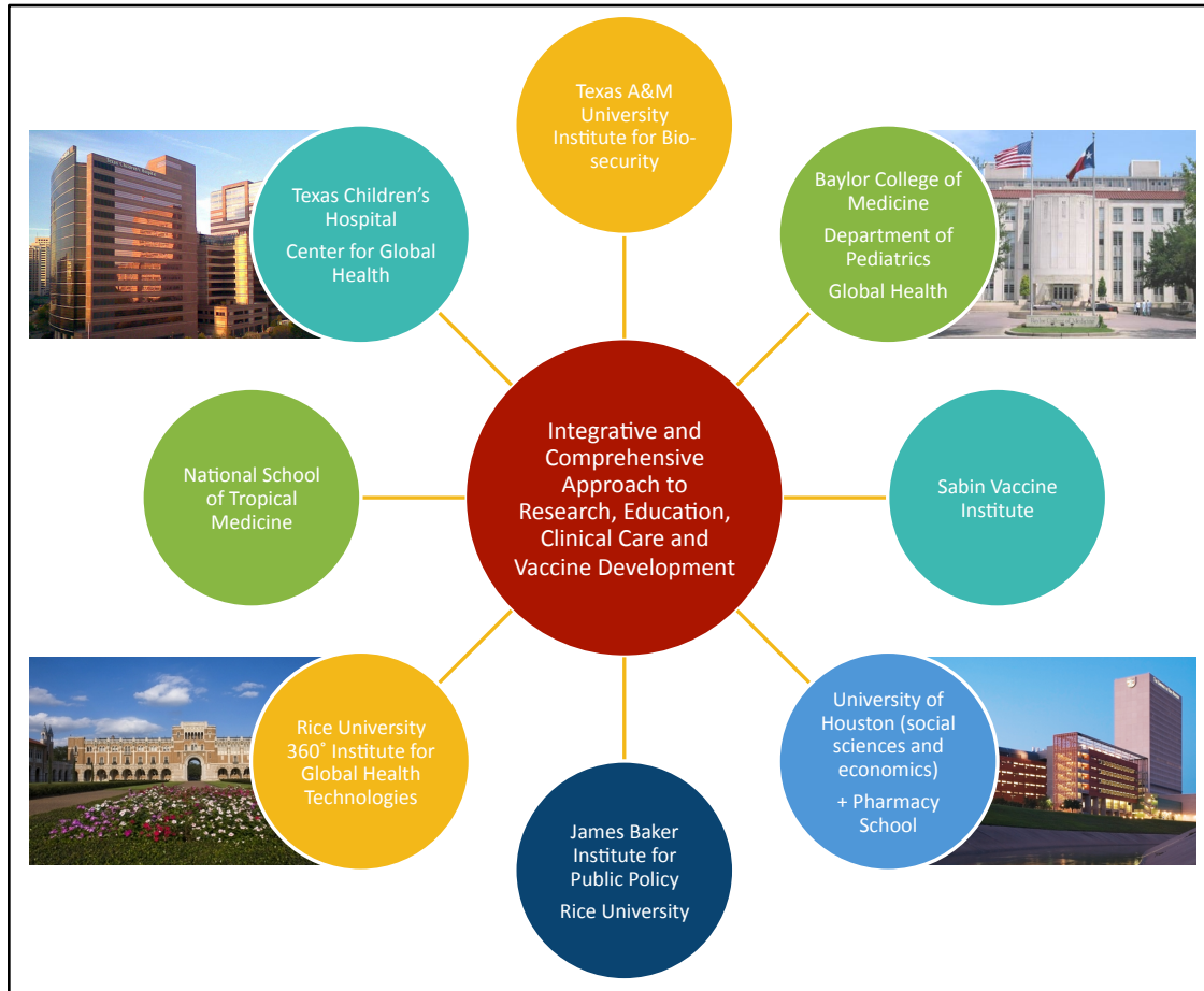
Figure 2: Institutional partnerships for advancing awareness and interventions for NTDs

These institutions form the foundation of an interdisciplinary and comprehensive national resource that aims to provide for the advancement of antipoverty interventions – within the areas of education, research, clinical care, and policy – that specifically target the poverty promoting features of NTDs and seek to prevent the socio-economic consequences of systemic pathologies. 36